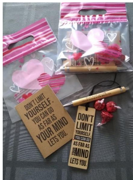
2024 Membership Mixer