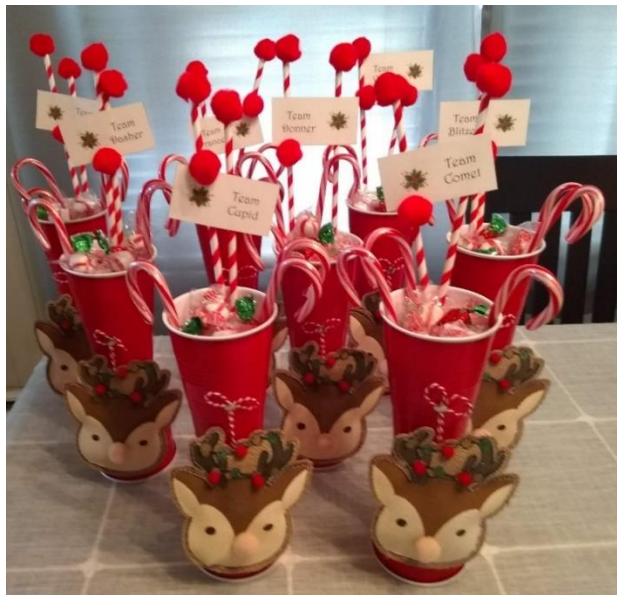
2023 Holly Folly Holiday Party

While events in 2023 were well-attended and successful, WSW did face some challenges. As with most things, post-pandemic has created a “new normal” requiring adjustment. Venues, fees for goods and services, and scheduling requirements have changed dramatically. In the coming year, events will be working to adapt our budget, creativity, and membership needs/wants to accommodate these changes.